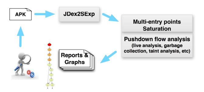
Figure 4: Software Architecture

The taint propagation analysis is not limited to detecting sensitive data leakage or tampering. As we discuss in Section 8, it can help analysts to find malicious behaviors, such as when SMS messages are blocked by a trigger condition or a limited resource is consumed, such as the local file system on the device being filled.